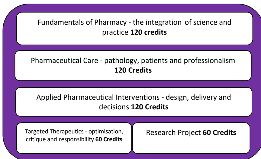
Figure 1: MPharm Structure

teaching pharmacy students from established schools has shown that some students do not really understand why they are learning basic pharmaceutical science at Stage1. They sometimes neglect this material or develop a very superficial understanding. This then leads to problems as the students progress, because they do not have sufficient foundation knowledge or a true understanding of the material and thus how to apply it. Demonstrating context and encouraging transferability is the main focus of this approach.